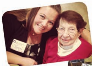
Enjoy time together!

FUNDRAISER and live music featuring the SPARKLETONES